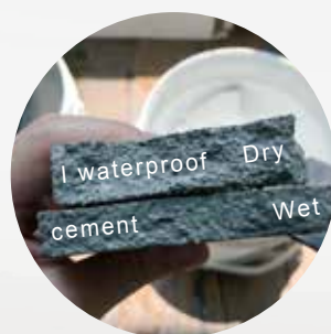
Endurance For More Than One Year Soaking In Water